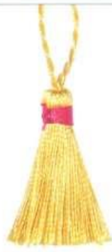
'Daffodil Small Tassel', 4cm, £1.65, from V V Rouleaux. vrouleaux.com