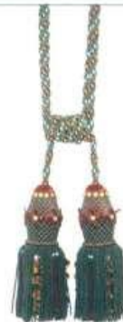
'Chateauroux Tie Back', 26cm, £900, from Watts of Westminster. watts1874.co.uk

PATTERNED TRIMS: to brighten up plain cushions and curtains